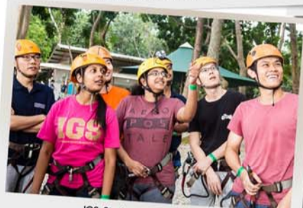
IGS Student Team Bonding