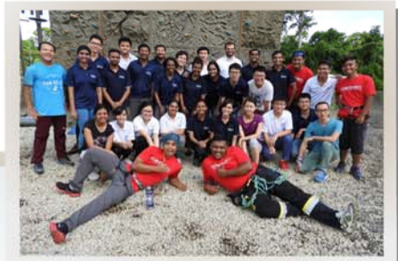
IGS Student Team Bonding