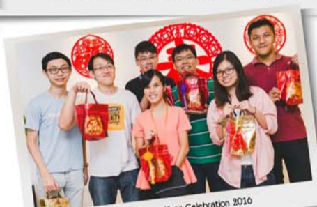
IGS Chinese New Year Celebration 2016