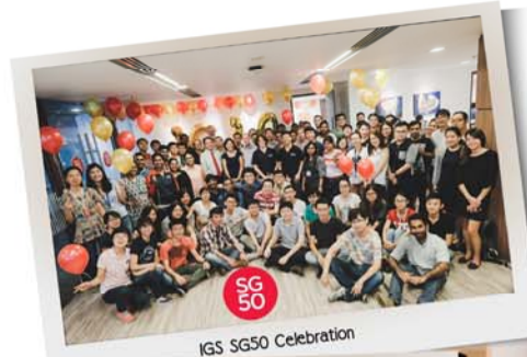
IGS SG50 Celebration