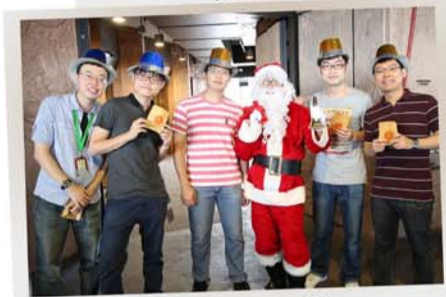
IGS Christmas Celebration 2015